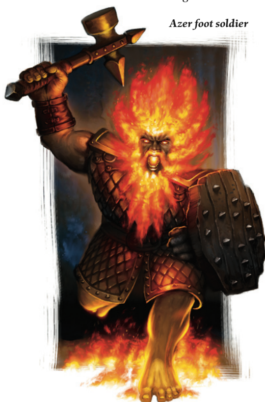
Azer foot soldier

DC 15: Long ago, all dwarves were slaves to the giants and titans. Today's dwarves are the descendants of those who freed themselves. Azers are dwarves that did not escape captivity before they were corrupted and transformed into fiery beings by their overlords. Although a few have escaped captivity since, most azers remain bound to their fire giant masters to this day.