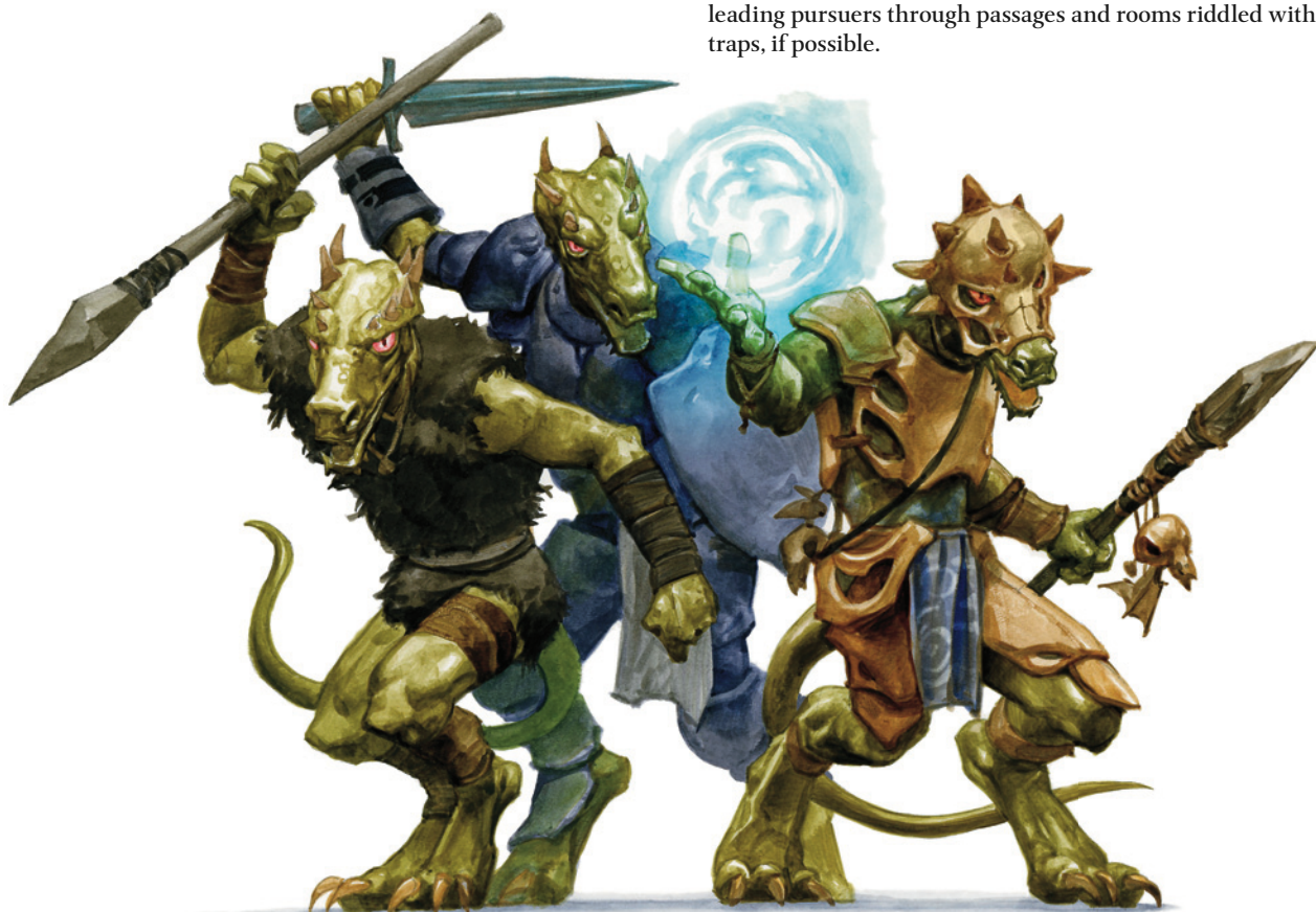
(Left to right) kobold skirmisher, kobold dragonshield, and kobold wyrm Priest

Kobold skirmishers gang up on a single target to gain the benefit of mob attack , shifting as a minor action to gain combat advantage. They retreat when the fight turns against them, leading pursuers through passages and rooms riddled with traps, if possible.