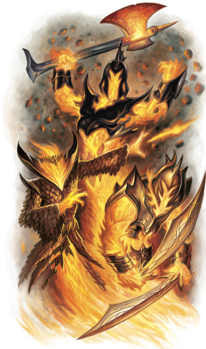
(Left to right) fire archon ash disciple, emberguard, and blazesteel

Two kinds of archons are presented here: fire archons and ice archons. These soldiers are bent on returning the world to the rule and whim of the primordials, and fire archons and ice archons have no issues working together to achieve their common goal.