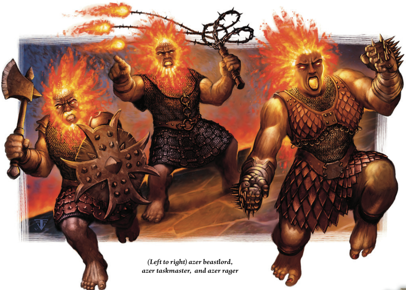
(Left to right) azer beastlord, azer taskmaster, and azer rager

An azer beastlord is rarely encountered without elemental beasts of its level or lower. The beastlord waits until its charges are locked in battle before joining the fray, helping the beasts maneuver into flanking positions so that it can take advantage of its on my command power.