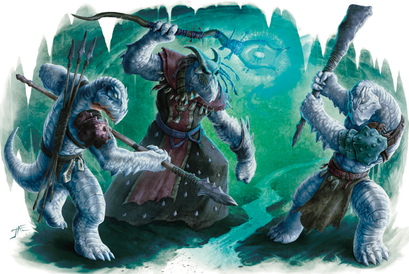
(Left to right) troglodyte impaler, troglodyte curse chanter, and troglodyte mauler