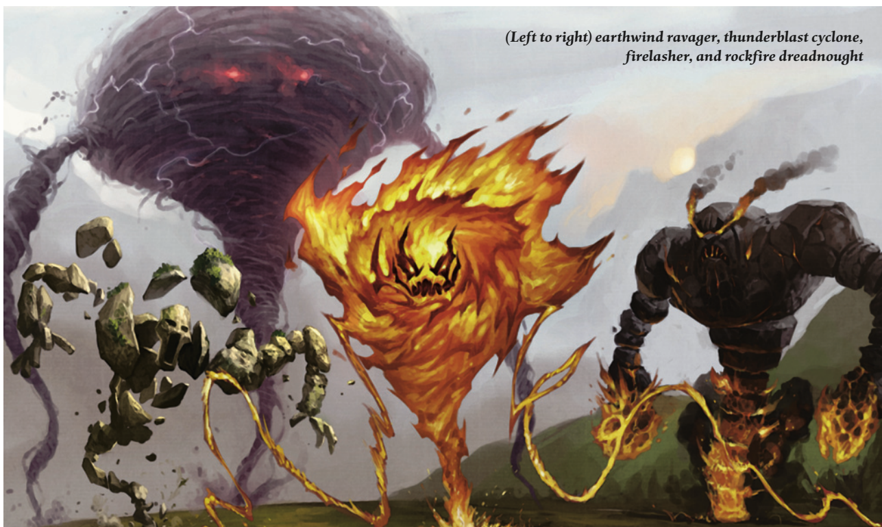
(Left to right) earthwind ravager, thunderblast cyclone, firelasher, and rockfire dreadnought