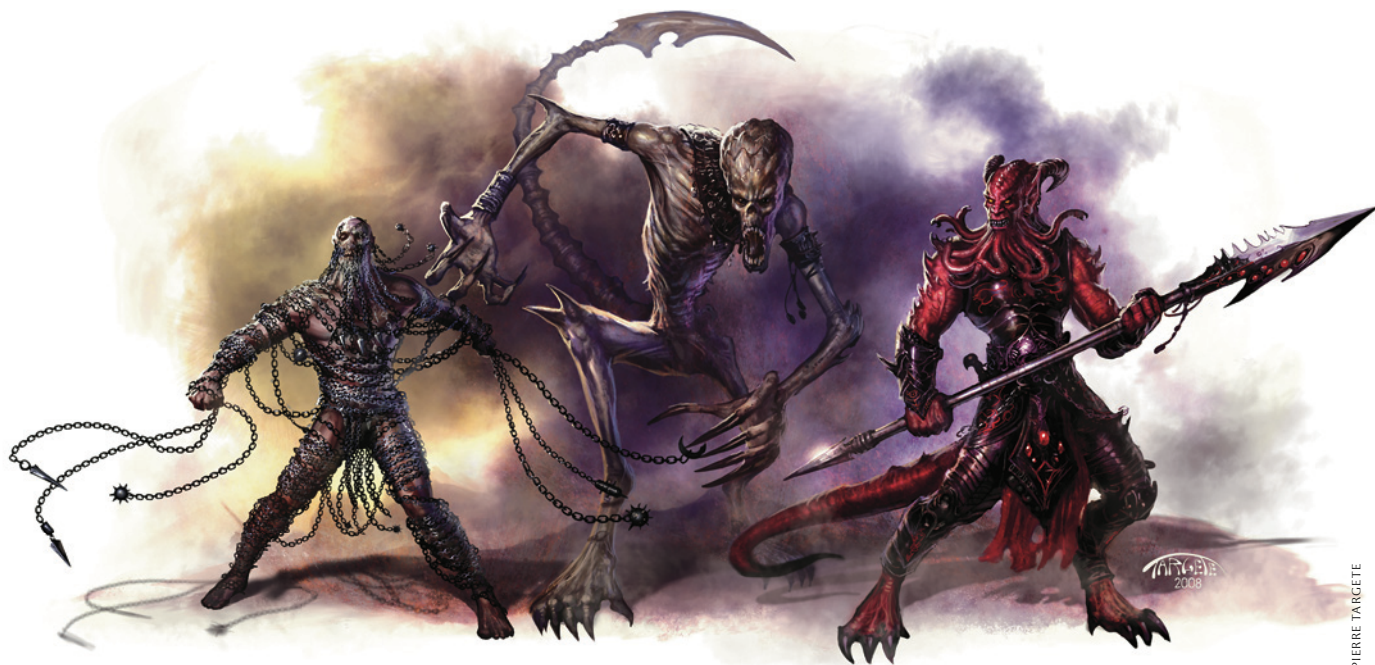
(Left to right) chain devil, bone devil, and bearded devil

A character knows the following information with a successful Religion check.