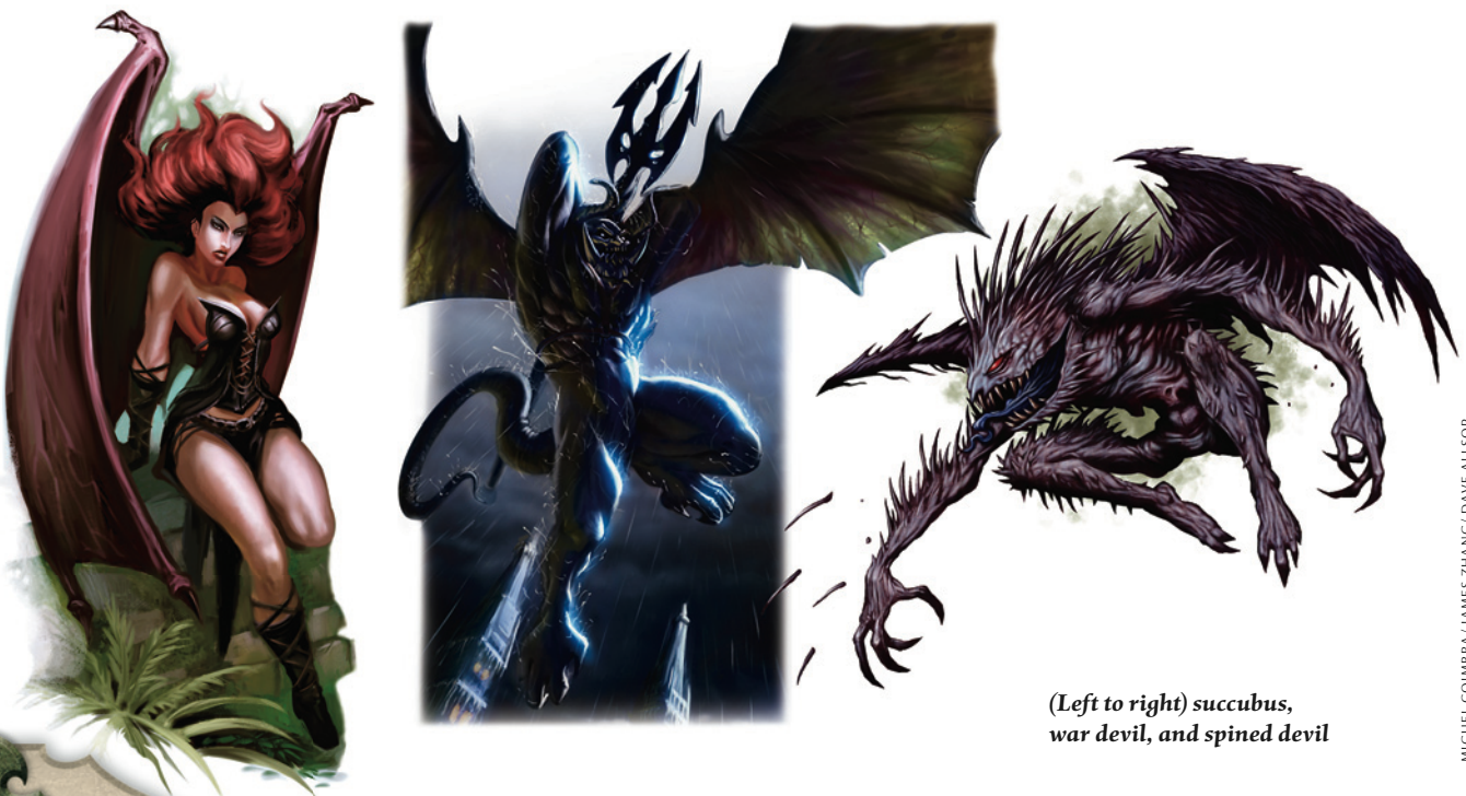
(Left to right) succubus, war devil, and spined devil

While flocks of spined devils are common in the Nine Hells, they're most often encountered in fewer numbers in the material world and often in the company of other evil creatures.