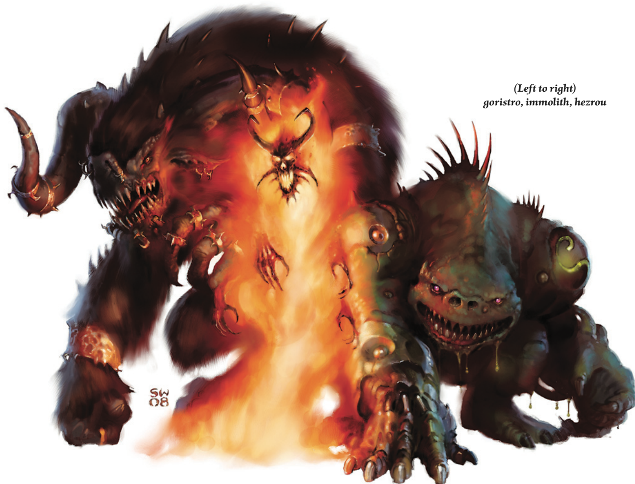
(Left to right) goristro, immolith, hezrou