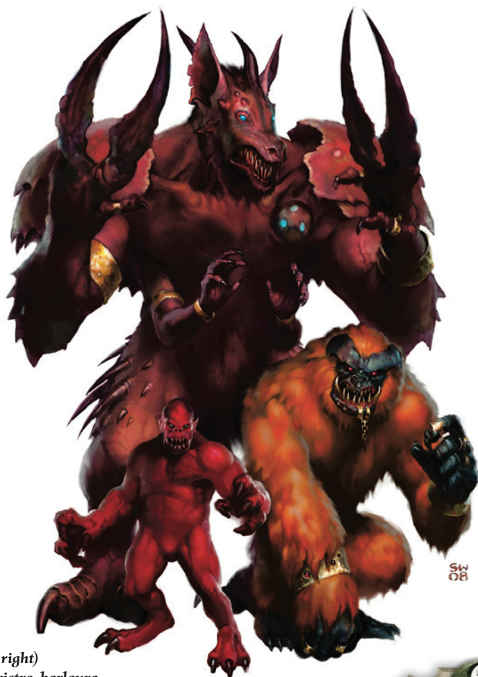
(Top, left to right) glabrezu, evistro, bargura

A bargura charges into battle, using its double attack to pummel its opponents.