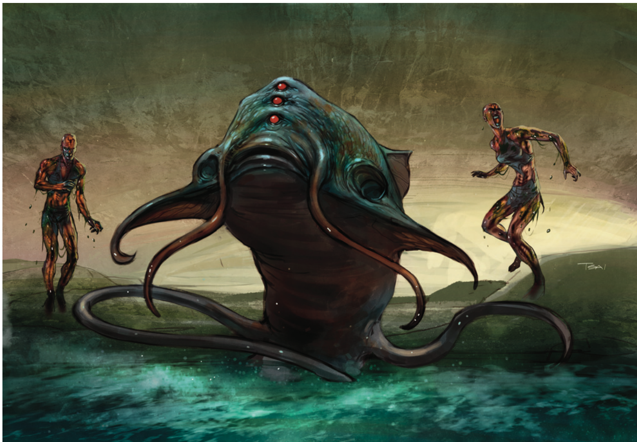
An aboleth overseer and its aboleth servitors

DC 30: Sometimes aboleths live together as a brood or even in a collection of broods. Aboleth overseers also populate their lairs with humanoids that they've enslaved and transformed into slimy minions.