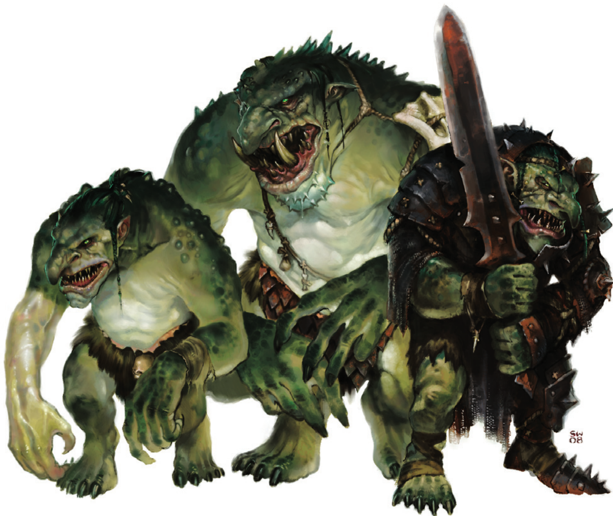
(Left to right) troll, fell troll, and war troll