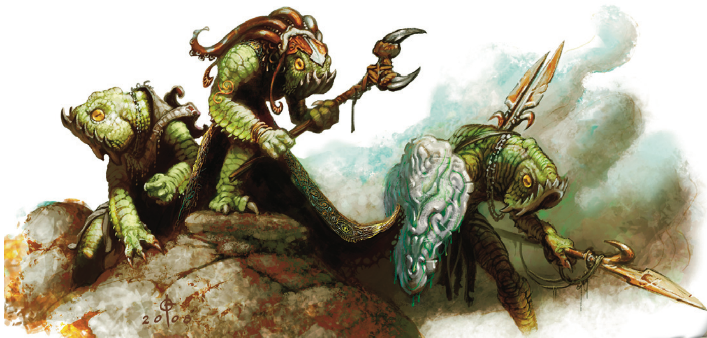
(Left to right) kuo-toa monitor, kuo-toa whip, and kuo-toa harpooner