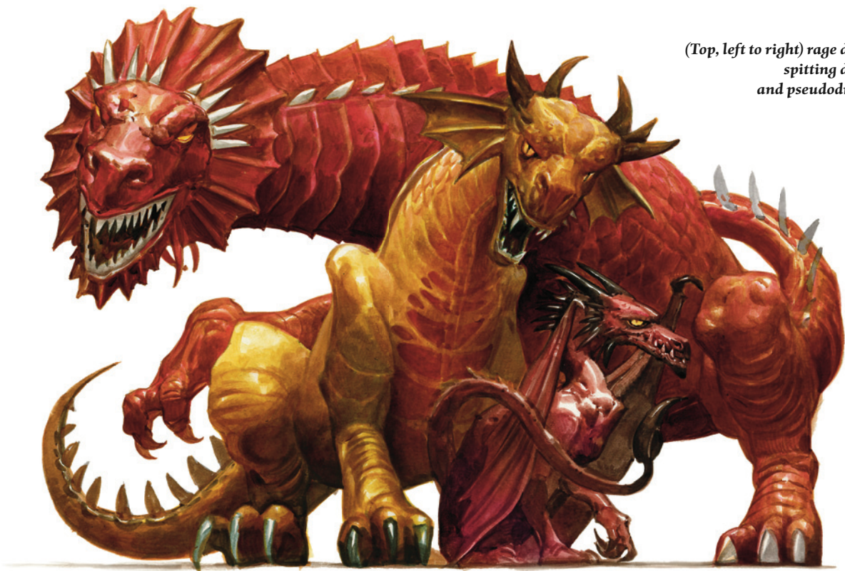
(Top, left to right) rage drake, spitting drake, and pseudodragon

DC 15: Spitting drakes make for messy pets, but humanoids train them as guardians nonetheless. In the wild, spitting drakes sometimes congregate with other drakes, such as guard drakes. Spitting drakes can also be found in clutches formed under a dominant rage drake that has no clutch of its own.