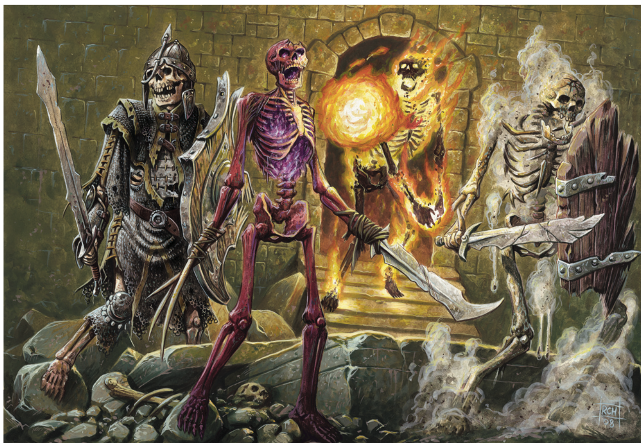
(Left to right) skeleton, boneshard skeleton, blazing skeleton, and decrepit skeleton