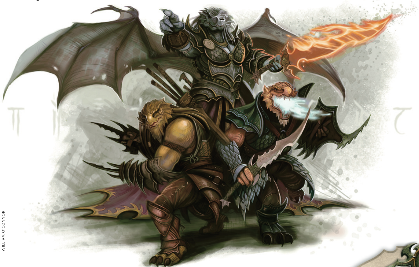
(Top, left to right) dragonborn champion, dragonborn raider, and dragonborn soldier