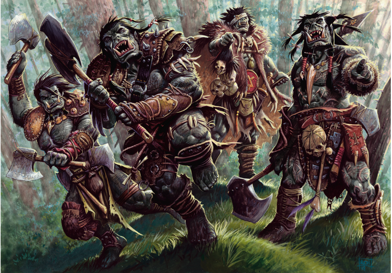
(Left to right) orc raider, orc bloodrager, orc eye of Gruumsh, and orc warrior