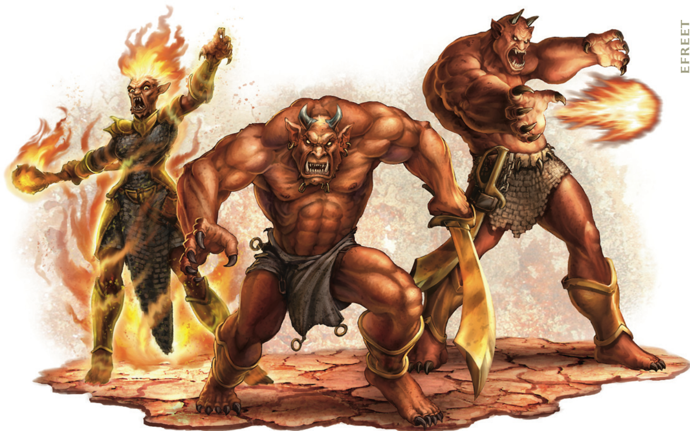
(Left to right) efreet pyresinger, efreet fireblade, and efreet cinderlord