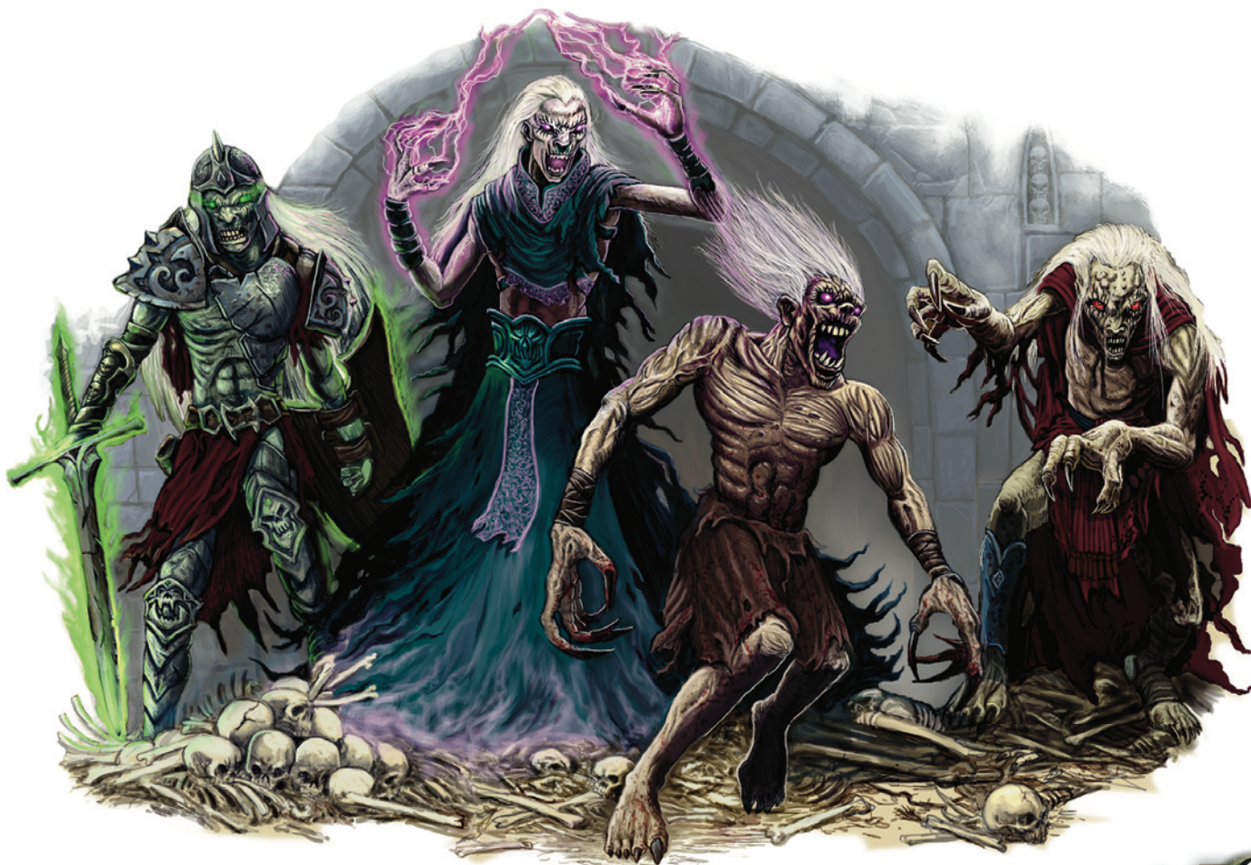
(Left to right) battle wight, deathlock wight, slaughter wight, and wight