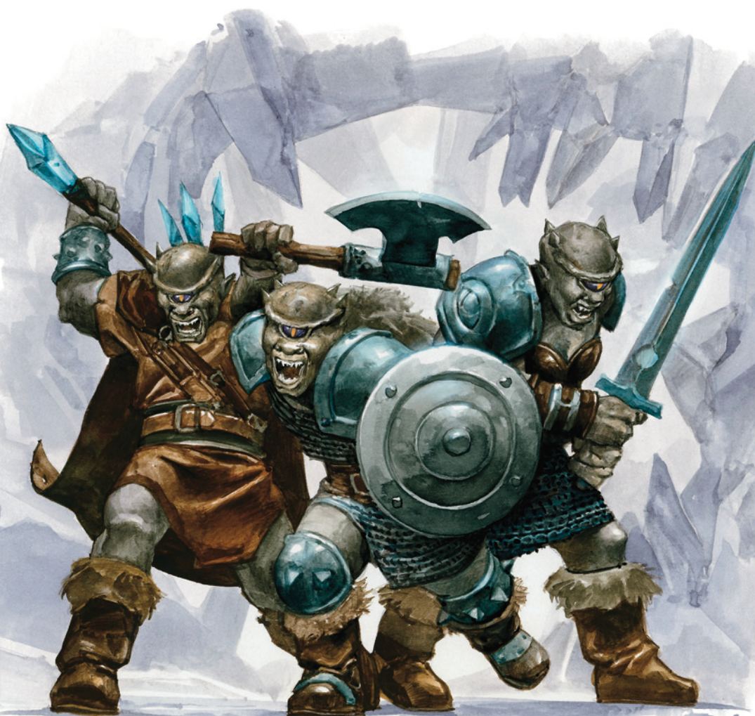
(Left to right) cyclops impaler, cyclops hewer, and cyclops rambler

A cyclops hewer uses its evil eye and then charges headlong into battle, cutting down enemies in its way.