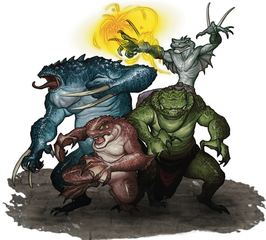
(Top left, clockwise) talon slaad, rift slaad, curse slaad, and blood slaad

A slaad tadpole avoids combat with creatures larger than itself. When cornered, it makes bite attacks. These attacks cause the creature to momentarily destabilize and become insubstantial. Both this and its chaos shift power are defense mechanisms that protect it against enemy attacks.