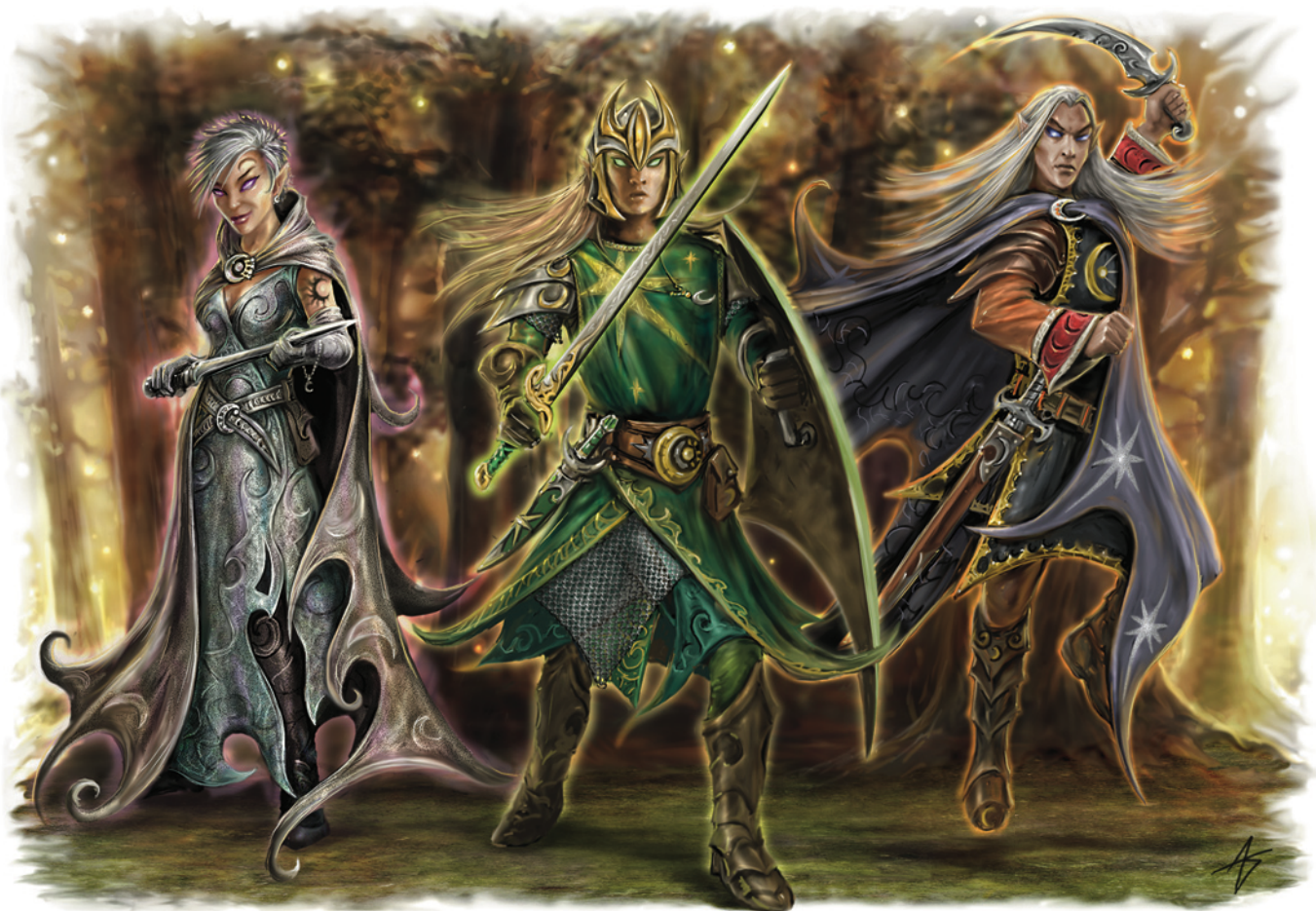
(Left to right) ghaele of winter, eladrin fey knight, and bralani of autumn winds