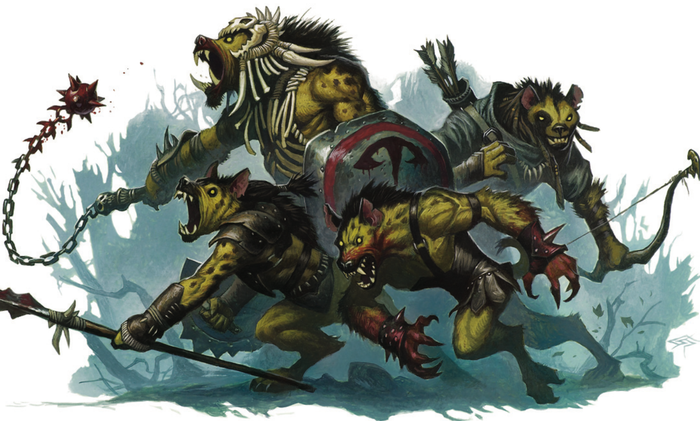
(Left to right) gnoll marauder, gnoll demonic scourge, gnoll clawfighter, and gnoll huntmaster