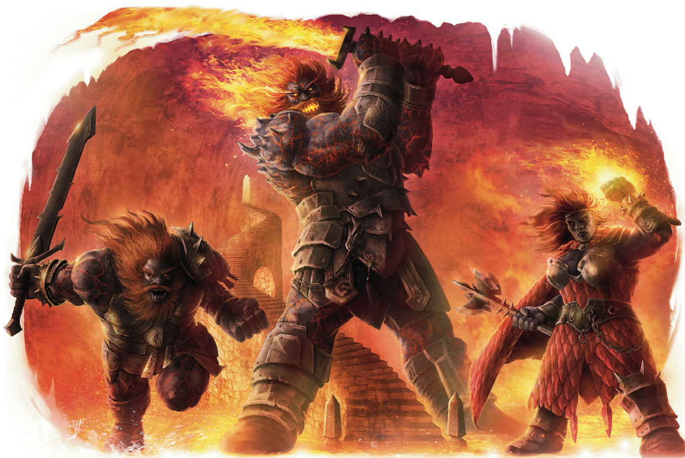
(Left to right) fire giant, fire titan, and fire forgecaller

A fire giant forgecaller prefers to stay on the outskirts of battle, using fire pillar and flame burst to incinerate enemies.