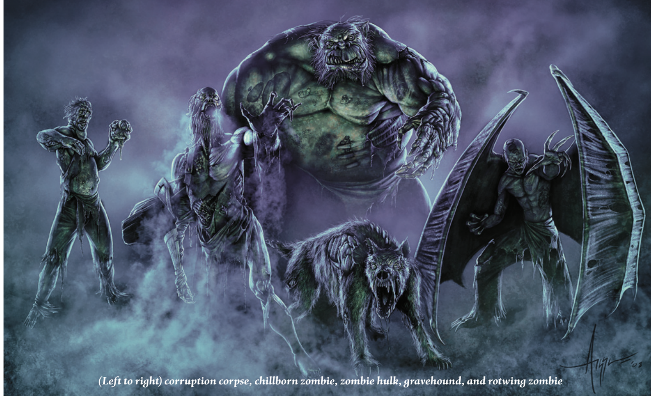
(Left to right) corruption corpse, chillborn zombie, zombie hulk, gravehound, and rotwing zombie