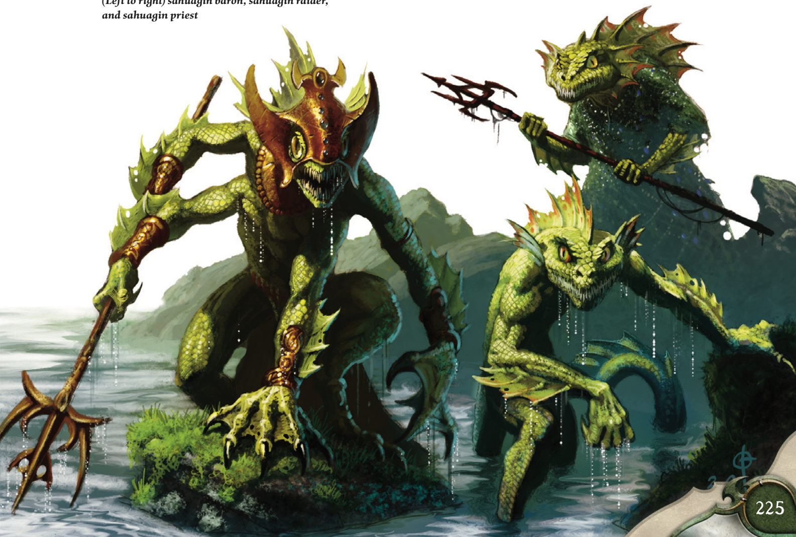
(Left to right) sahuagin baron, sahuagin raider, and sahuagin priest