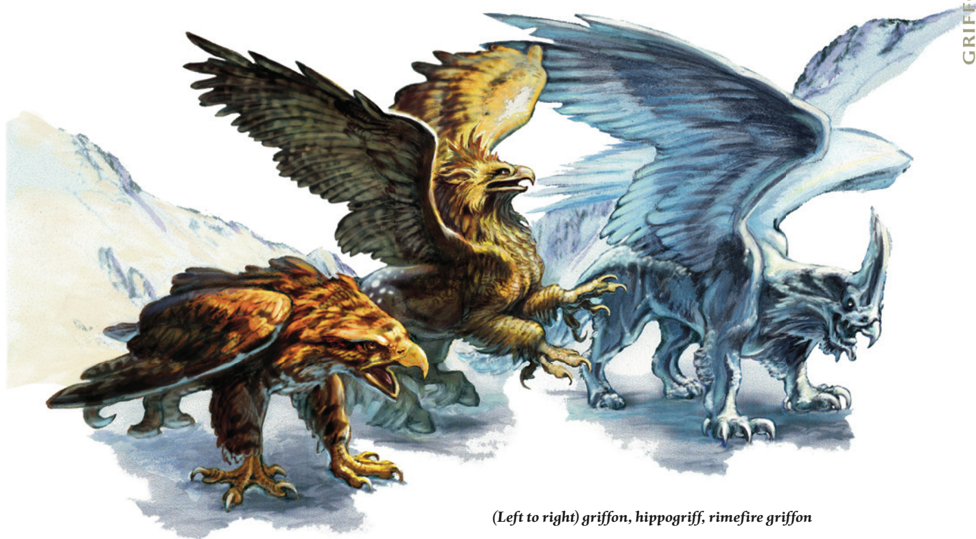
(Left to right) griffon, hippogriff, rimefire griffon