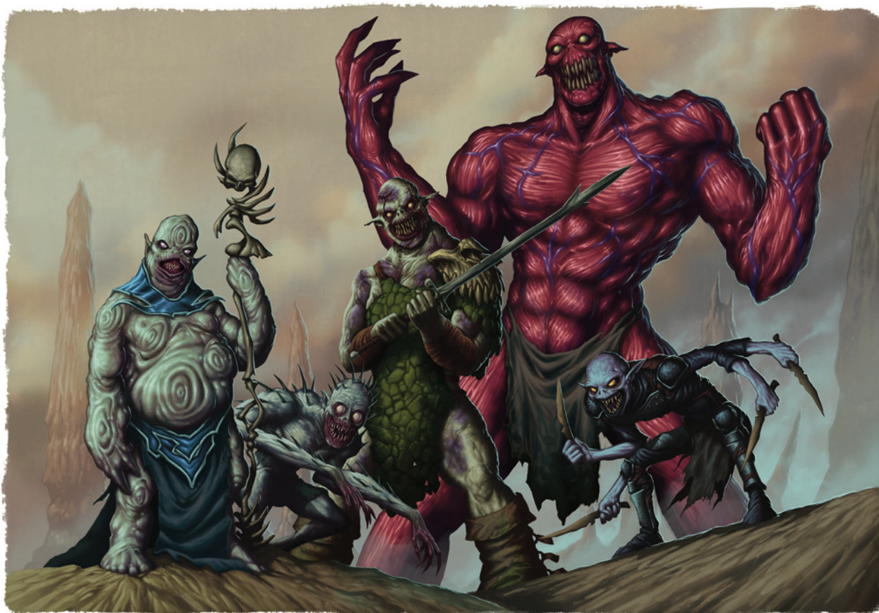
(Left to right) foulspawn seer, grue, berserker, hulk, and mangler