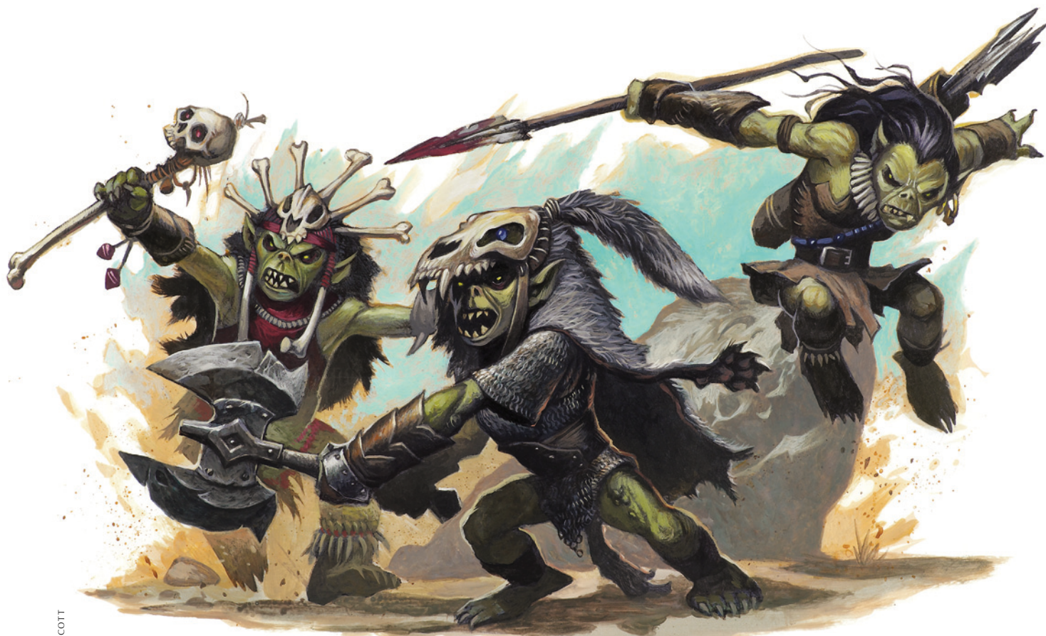
(Left to right) goblin hexer, goblin skullcleaver, and goblin warrior

Hobgoblin soldiers form neat lines on the battlefield to gain the benefit of phalanx soldier . A soldier that is pushed or slid out of formation uses formation strike to move adjacent to a hobgoblin ally after an attack.