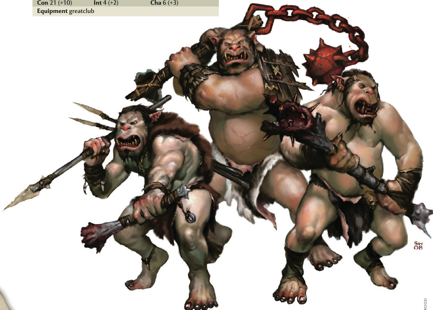
(Left to right) ogre skirmisher, ogre warhulk, and ogre thug

Bludgeoners typically fall under the domination of stronger and smarter monsters such as hags, oni, or giants. Left to their own devices, they simply beat enemies to death with their clubs.