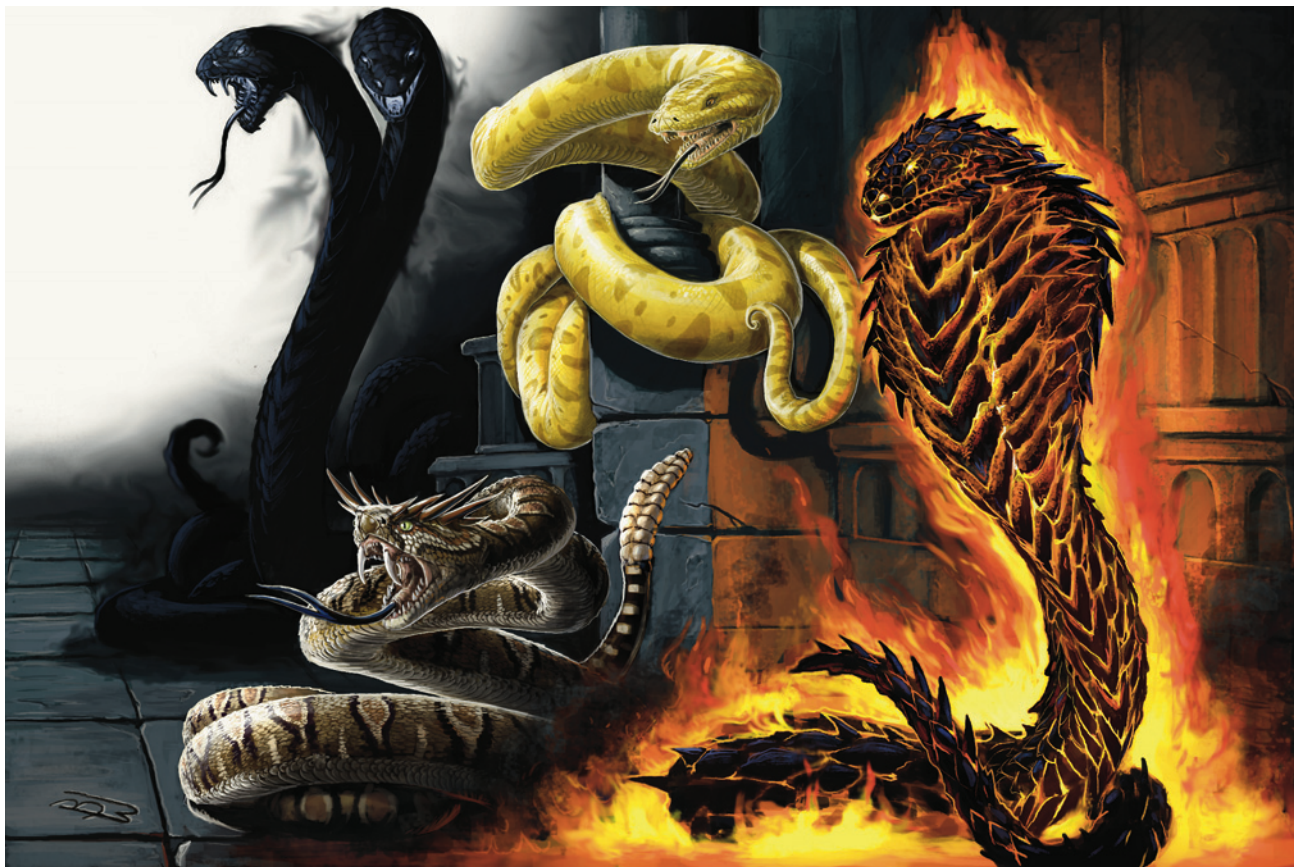
(Left to right) shadow snake, deathrattle viper, crushgrip constrictor, and flame snake