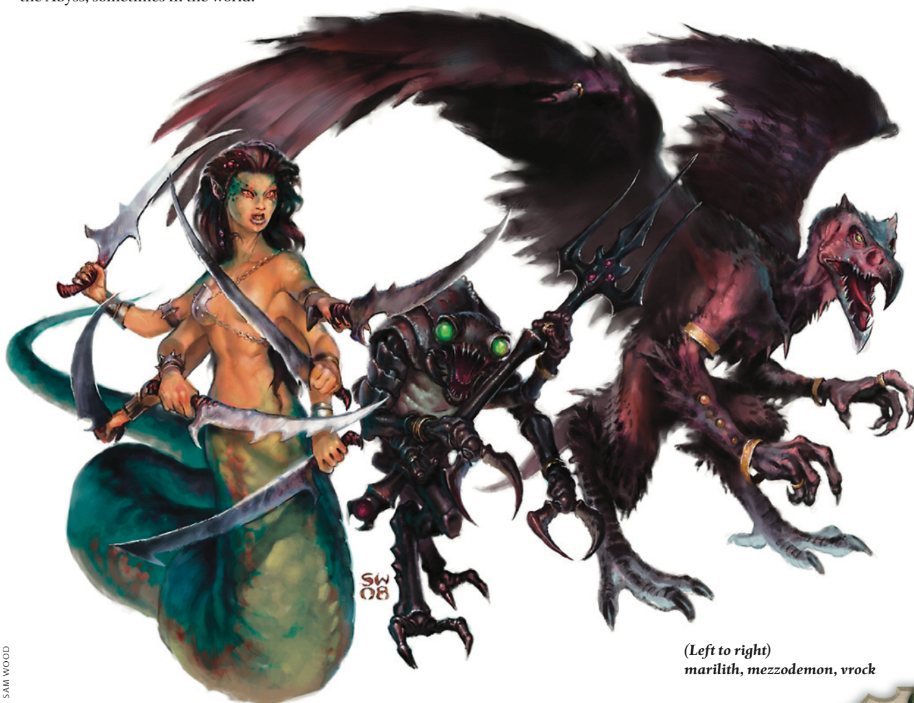
(Left to right) marilith, mezzodemon, vrock