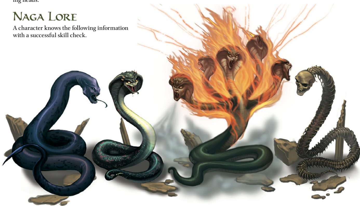
(Left to right) dark naga, guardian naga, primordial naga, and bone naga