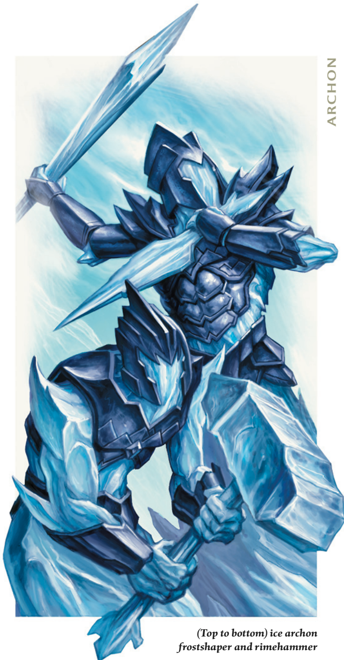
(Top to bottom) ice archon frostshaper and rimehammer

Archons work with elemental creatures of all types, and they have no aversion to working with creatures not of their element. For example, it's not unheard of for an efreet to have a contingent of ice archon mercenaries among its other soldiers.