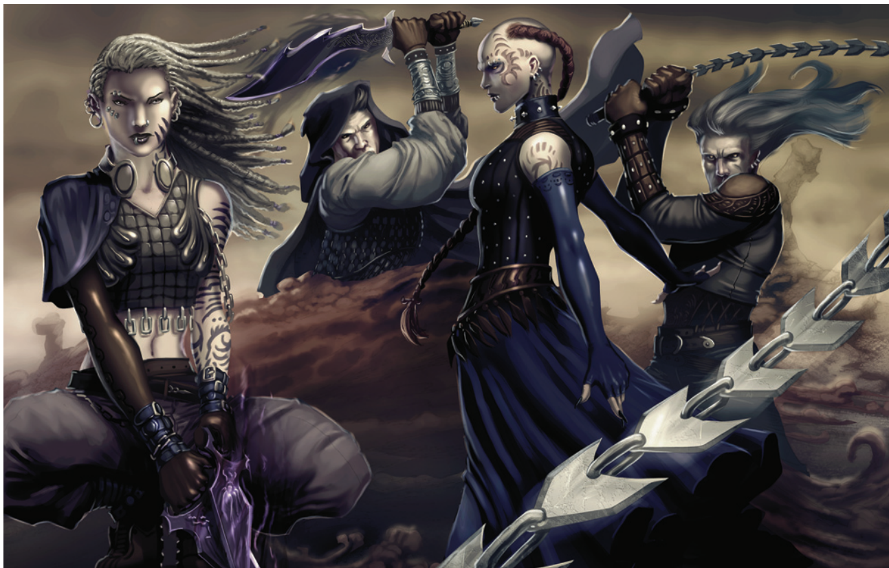
(Left to right) shadar-kai warrior, shadar-kai gloomblade, shadar-kai witch, and shadar-kai chainfighter