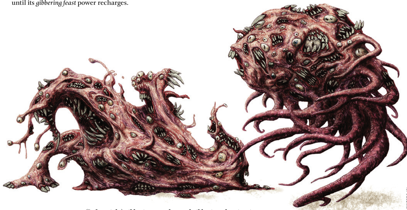
(Left to right) gibbering moulder and gibbering abomination

This beast uses its gibbering power every round while holding off foes with its unnatural utterances aura. It uses eye of despair against a dazed foe at range, gaining the benefit of combat advantage. In melee, it uses its tentacles to attack dazed opponents, against whom it has combat advantage.