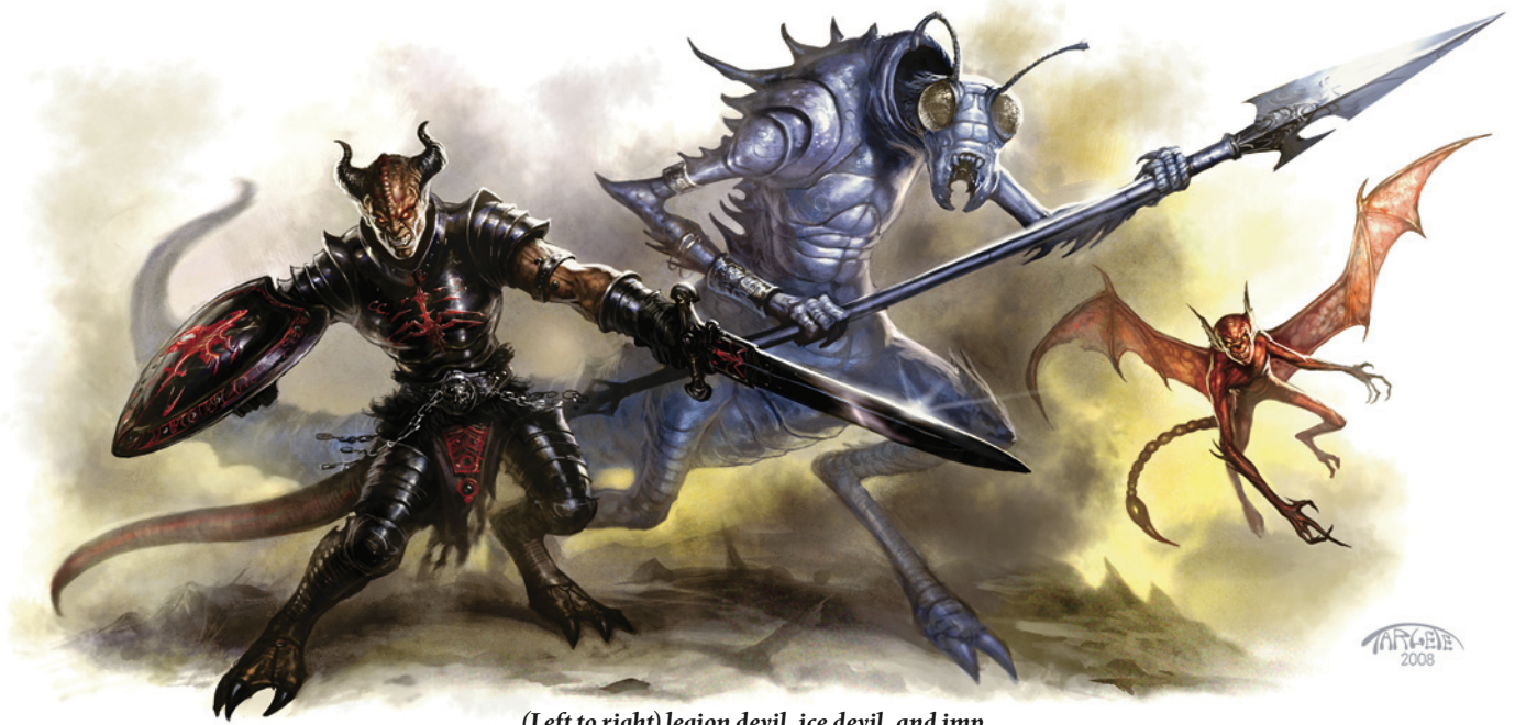
(Left to right) legion devil, ice devil, and imp